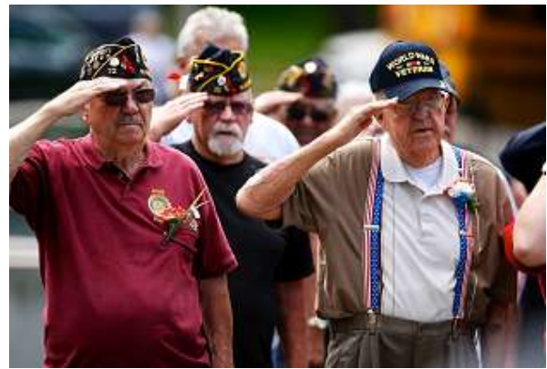
Several Post 72 members salute during the Memorial Day Service at the Warrenton Cemetery