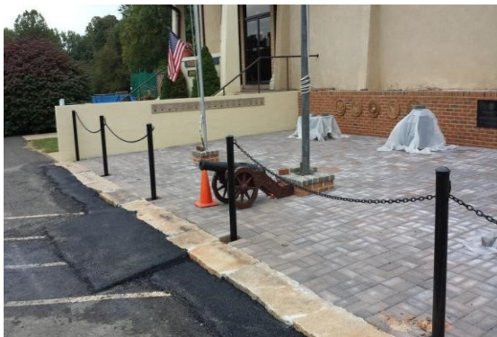
Veterans Plaza with bollards, (posts), chains and the new asphalt installed