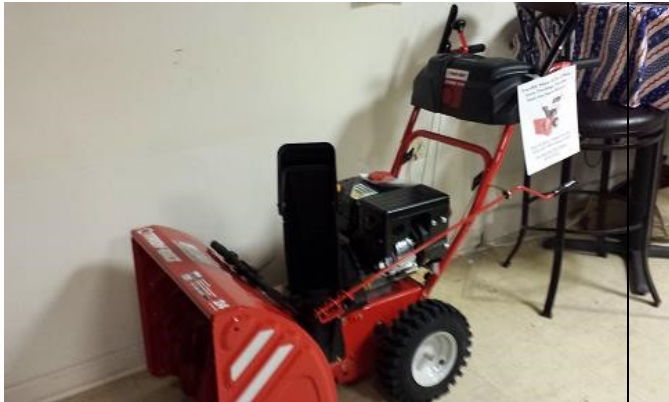
Snow blower raffle tickets are on sale Now, $1.00 each

Phone: 540-347-7740 Fax 540-347-2645 www.LegionPost72.org