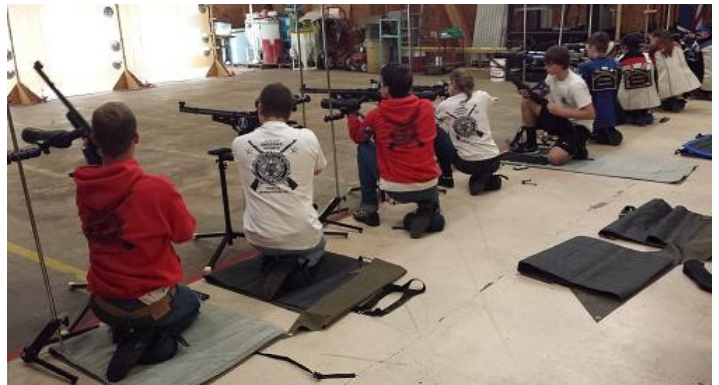
Post 72 Junior Shooters take aim in Hampton, Virginia