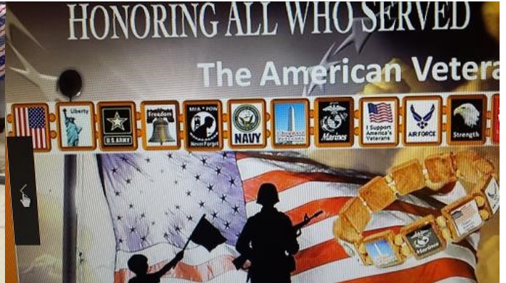
Veteran's bracelets on sale, $2.00 each