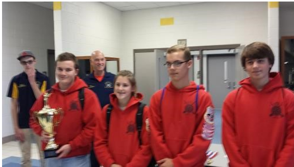
Post 72 Junior Shooters proudly display their First Place Trophy won at King George, Virginia recently