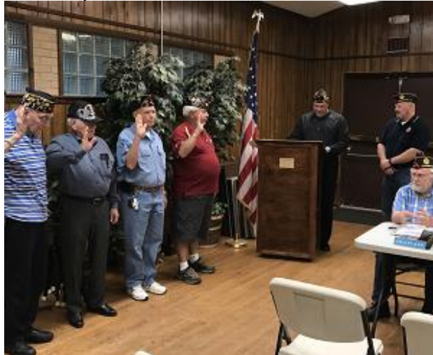
Newly elected Post 72 Corporate Officers are sworn in at the June Business meeting