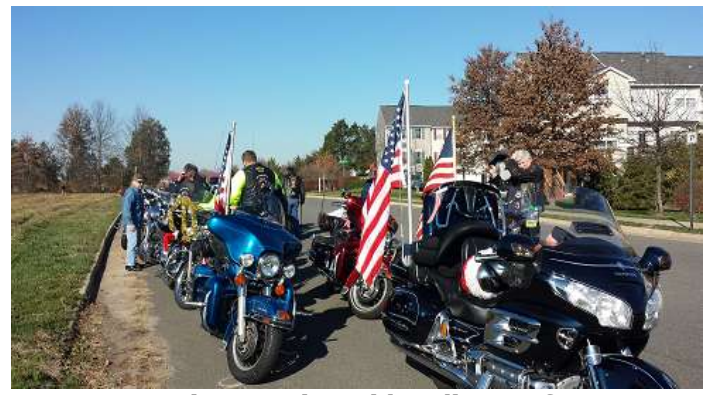
Post 72 American Legion Riders line up for the Bealeton Christmas Parade.